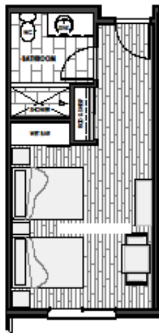
Standard Hotel Room: 2 Double Beds, Non-smoking, Refrigerator.