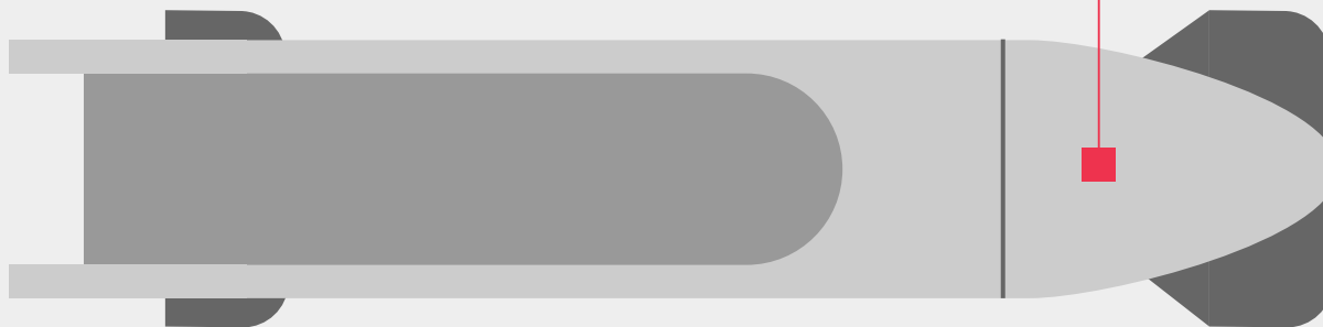
Top view Bobsleigh